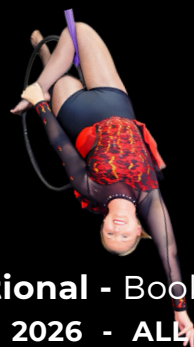
Photo packages will be required to be paid for upon booking. All Photo packages will be sent via digital download once ready. A timetable will be sent out at a later date. There are limited spaces available.